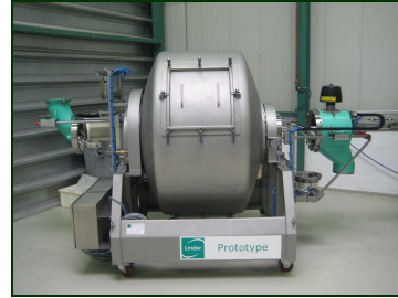
Lindor L750 with QSR