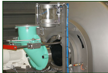
Detail of detached inlet